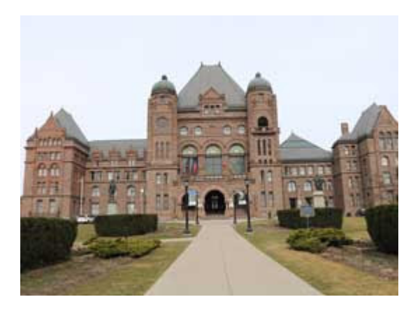
Unifor is hopeful about the future of skilled trades training and development following the announcement of Skilled Trades Ontario, a new, streamlined crown agency.