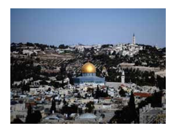
Unifor condemns escalating attacks on the people of Gaza, leading to a mounting death toll.